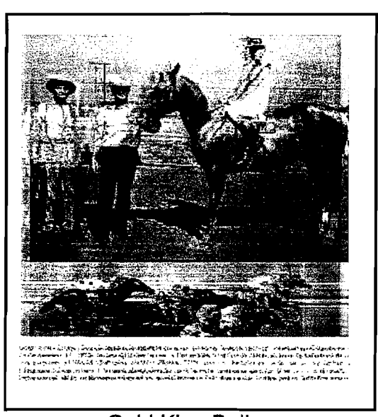
Gold King Bailey